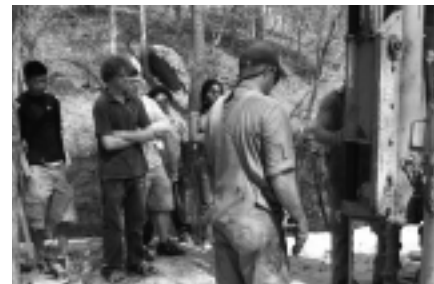
Students observing soils sampling by F&R.