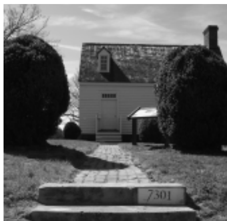
Portion of Historic Hillsman House