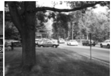
Partial public hearing display and photo taken on Derbyshire looking west.