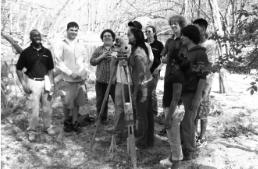
L.C. Bird students with AB&A personnel surveying the site.